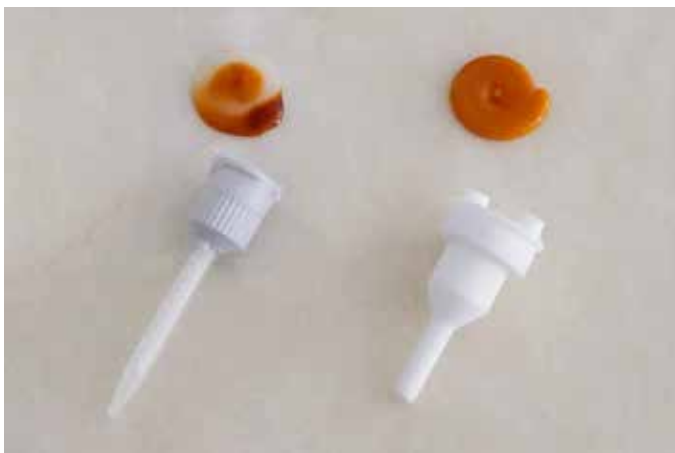
Comparison: Mixing result static mixing (left), mixing result dynamic mixing (right)

Result: The 2-component epoxy adhesive, which could not be processed by static mixing, is reliably mixed by dynamic mixing even at the lowest mixer speed and can be processed optimally.