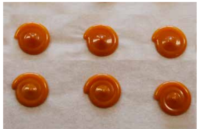
Mixing result eco-DUOMIX (dynamic mixing)